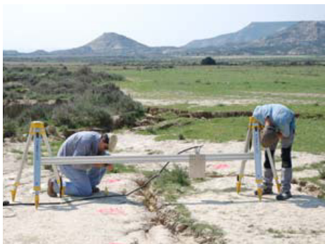
Fig. 3. Determination of a gully cross-section profile using a laser profilometer.

On the other hand, cross-section profiles in the same location as before were obtained by field survey. These were determined by using a laser profilometer (Fig. 3). Where the extremely large width and depth of the largest gully prevented the use of the profilometer, cross-section profiles were obtained instead by means of a total station.