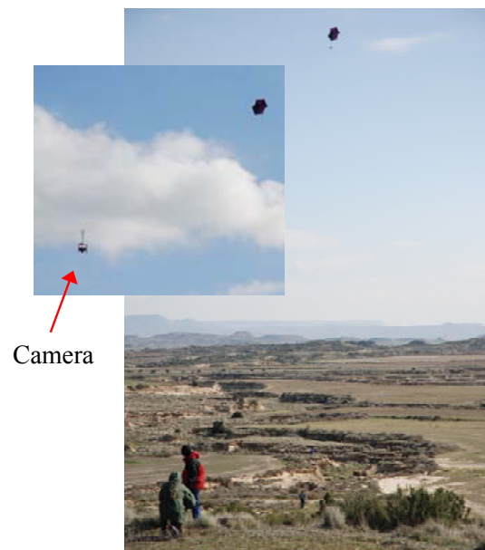
Fig. 2. Kite used as an aerial camera platform.