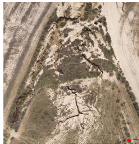
Fig. 1. Aerial picture of the experimental plot showing different types of gullies. A person in the lower, right-hand margin for scale (see arrow). Bardenas Reales, Navarre, Spain.

gullies of different sizes and morphologies, was selected to carry out the experiments (Fig. 1).