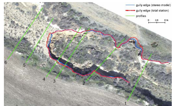
Fig. 4. Aerial view of the largest studied gully. Transverse lines indicate the exact position of each of the six gully cross-section profiles.

Hitherto, 12 cross-section elevation profiles have been obtained from 6 transects located along the largest gully headcut (Fig. 4): from each transect we determined a pair of elevation profiles, one by photogrammetry and the other one by using the total station (Fig. 5). At this point, it is important to mention that this large gully underwent local collapses of its walls and headcut. This occurred after the image capture and before mapping the entire surface height with the total station. However, only two of the aforementioned elevation profiles were affected by some change at the southern gully wall, all other areas remaining largely unchanged. Each pair of elevation profiles was plotted apart for a better comparison (Fig. 5). It can be seen that there is a remarkable match between equivalent profiles. Nevertheless, a lesser concordance between both set of result was observed in some spots densely cover by shrubs. Here, relative surface height is somewhat overestimated by photogrammetry since soil surface is (partially) hidden by the vegetation canopy.